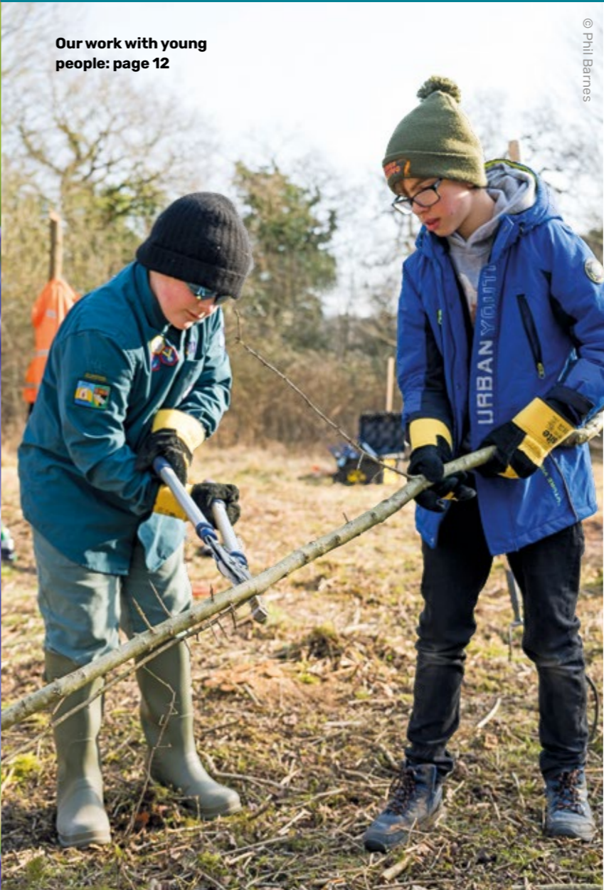
Our work with young people: page 12