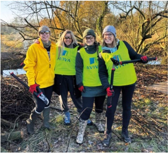
Above: Investors in Wildlife Aviva volunteering at a NWT work party Right: A generous donation from Siemens Energy funded the venue and training costs of 15 Wilder Communities workshops

Our community fundraisers worked with spirit throughout the year. Supporters took on sponsored challenges, displayed collection boxes, and gathered donations through our six local groups. Together, their efforts raised over £11,000, making a significant impact in supporting our cause and strengthening our local communities.