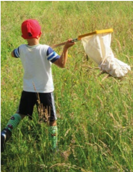
Above: We launched Wild Youth Action to connect 11-25-year-olds with nature

We celebrated the end of our four-year 'Watery Wildlife' project. This connected over 2,000 local children and community groups with the unique wetland habitats at NWT Thompson Common and beyond. Through school visits, workshops, open days, and creative activities like wildlife films, we significantly increased local knowledge and appreciation of nearby species like the northern pool frog. The project was part of the Brecks Fen Edge and Rivers Landscape Partnership supported by the National Lottery Heritage Fund.