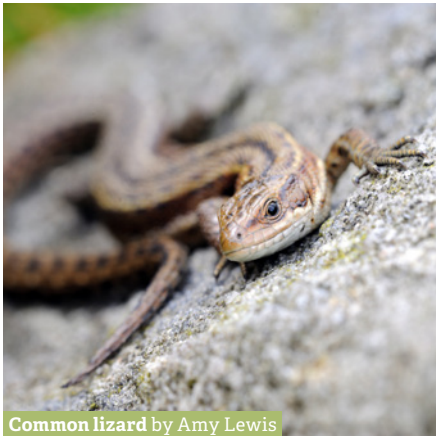
Common lizard