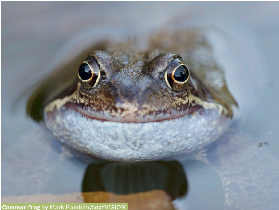
Common frog

Churchyards can be great places for amphibians and reptiles, and especially important for slow-worms and common lizard which have declined elsewhere. If the churchyard is close to ponds you may even find common frogs, common toads and newts. Open sunny spots as well as sheltered areas such as hedge bases and longer grass areas provide food and shelter.