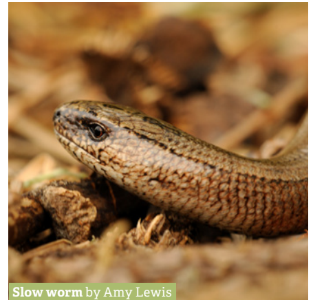
Slow worm by Amy Lewis

Frogs have slender bodies, smooth skin and jump and hop, whereas toads have more bulbous bodies, dry, warty skin and tend to crawl. Frog's hind legs are long with webbed feet. They have a distinctive brown patch behind their eye. Their skin colour varies from grey, green and yellow to shades of brown. Check out hedge bases, long grass and woodland edges to see them.