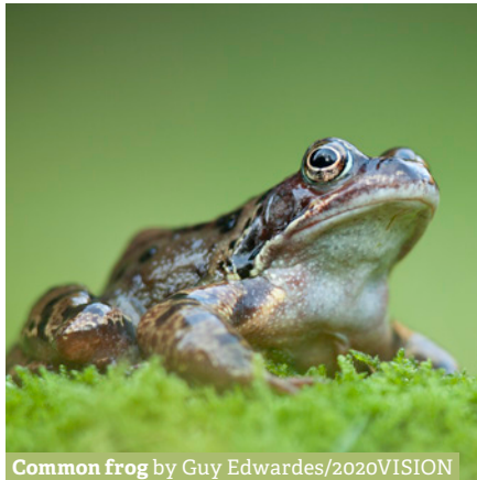
Common frog

The common lizard is a colourful character, being a shade of brown with patterns of spots or stripes. Colour variants are not uncommon: everything from yellow through various shades of green to jet black can be encountered. Check out open sunny spots near dense cover, but be quick, they tend to move fast when discovered.