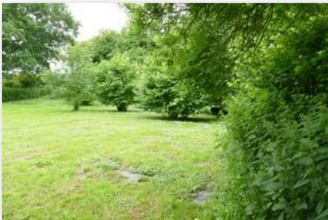
Open grassland with coppiced hazels – South-east of Smee (Steve Pinnington)

The southern grassland had been kept cut short in 2018, but the path through the nettle bed remained uncut at the time of surveying.