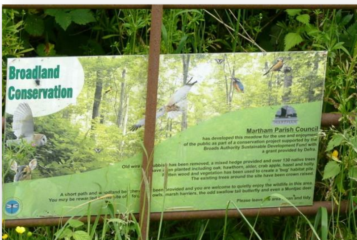
Interpretation board on the main gate into the smee land (Steve Pinnington)