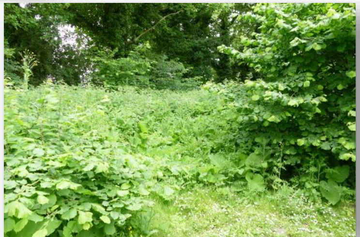
Nettle patch in the west corner (Steve Pinnington)