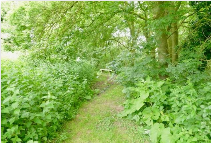
Path running between wet carr woodland and meadow area (Steve Pinnington)