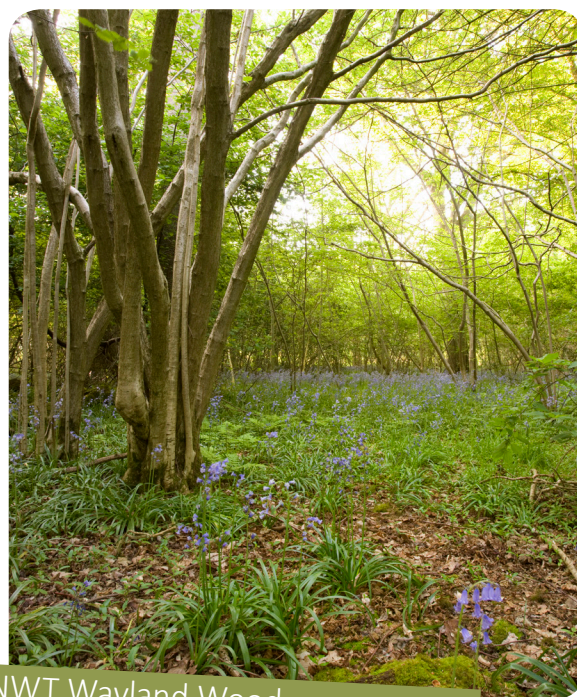
NWT Wayland Wood