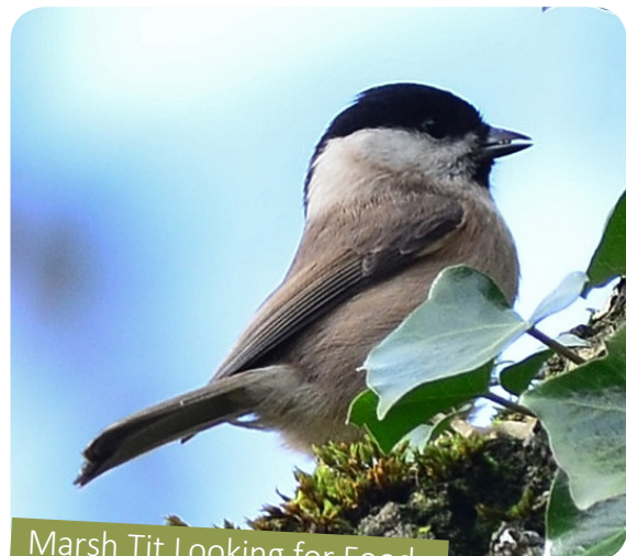
Marsh Tit Looking for Food