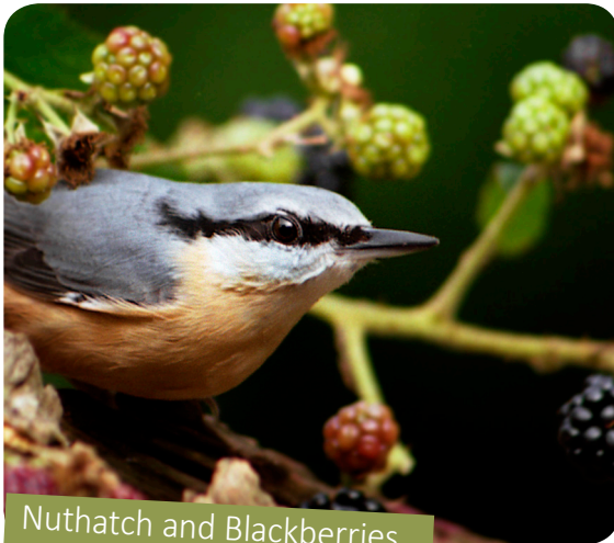
Nuthatch and Blackberries