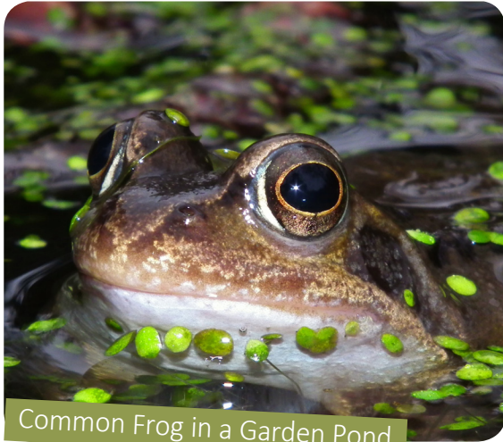
Common Frog in a Garden Pond