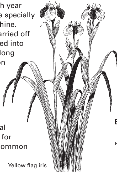
Yellow flag iris

In summer management includes the mowing of pathways which create ideal open, sheltered conditions for grass snakes, adders and common lizards to bask in the sun.