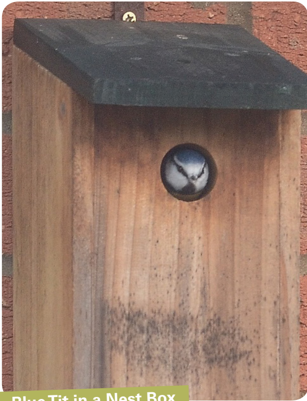
Blue Tit in a Nest Box