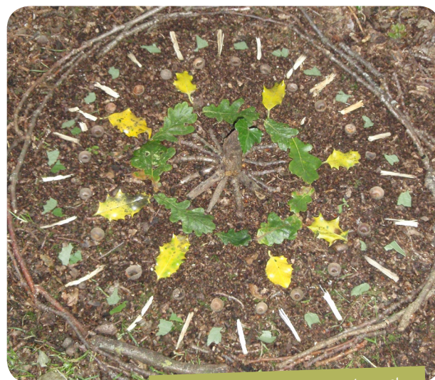
Using nature to create art