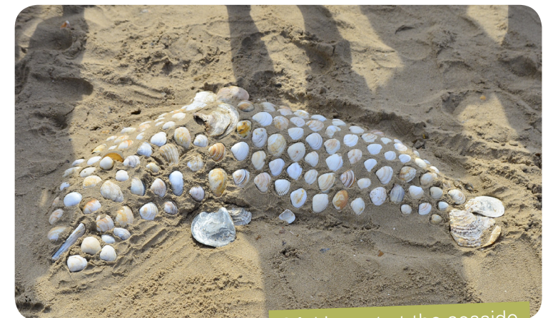
Making art at the seaside